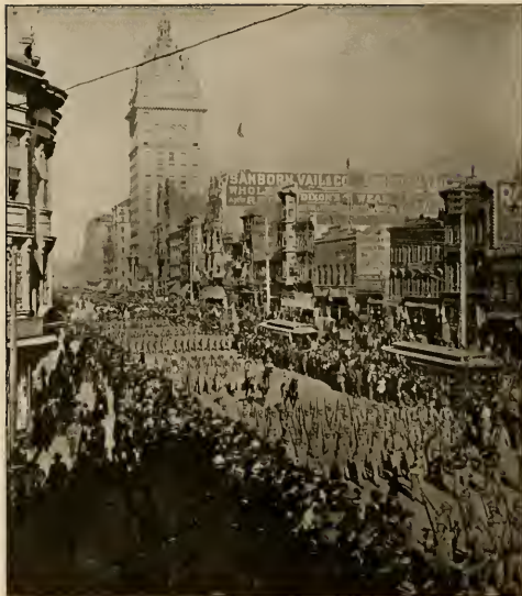
TWENTIETH KANSAS MARCHING ON MARKET STREET, SAN FRANCISCO, AFTER ITS RETURN FROM THE PHILIPPINE ISLANDS.